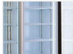
Inner LED light