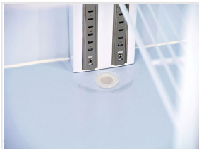
Bottom hole for easily clean and dry the item