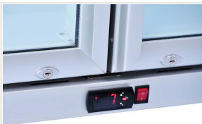
Digital thermostat and independent light switch